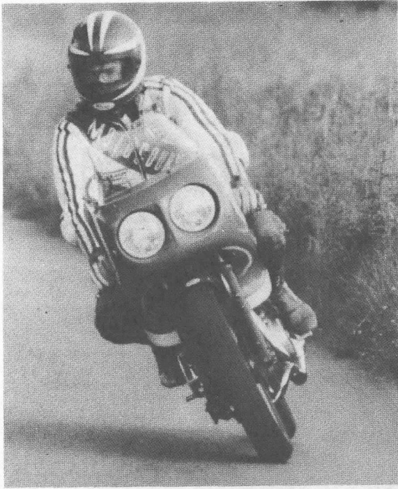
Braking into a corner on a country road, the Ducati is in its element.

(The following article is from MOTORCYCLE WEEKLY a British magazine that gives excellent coverage of all the weekly events taking place in the motorcycle world. Our thanks to them for the use of this piece.)